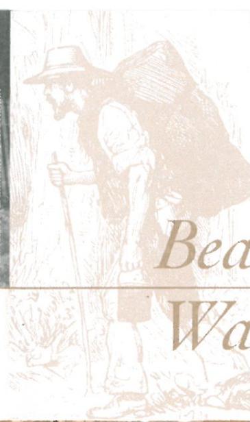
COVER: NATIONAL LIBRARY OF AUSTRALIA